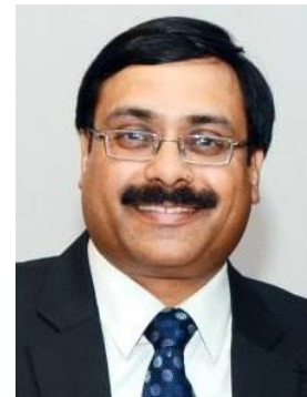
B. COM (H), FCA, FCS, FCMA, LL.B, MIMA, DISA, IP Cleared self-assessment test for Independent Directors Database